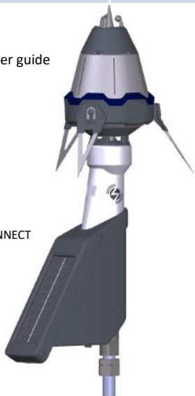
PREVECTRON 3 ® TS25 CONNECT